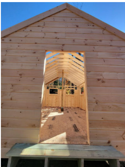
The new STEM building under construction

The program's evolution is not just about learning to code or build robots; it's about teaching resilience, creativity, and the joy of discovery. We can't wait to see what our campers will build next summer!