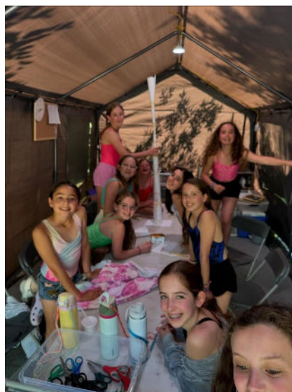
Campers enjoying their ingenuity and creativity during a STEM class