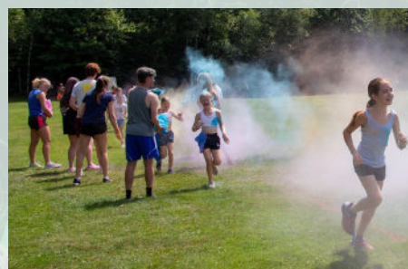
Campers running through blasts of color powder to show support for Morry's Camp

When you donate to Morry's Camp, you're not just giving money—you're giving opportunities. For many of the campers at Morry's, the experience is more than a week away from home. It's a chance to discover their strengths, make lifelong friendships, and learn life skills that will serve them for years to come. Every dollar raised through our Fun Run and Play-A-Thon helps fund camper scholarships, leadership programs, and essential resources that make these life-changing experiences possible. Your contributions help fund year-round academic support, leadership training, and social-emotional learning programs that equip campers with the tools for future success. Through Project Morry's structured programs, participants build the skills, confidence, and support systems necessary to thrive in school, college, and beyond.