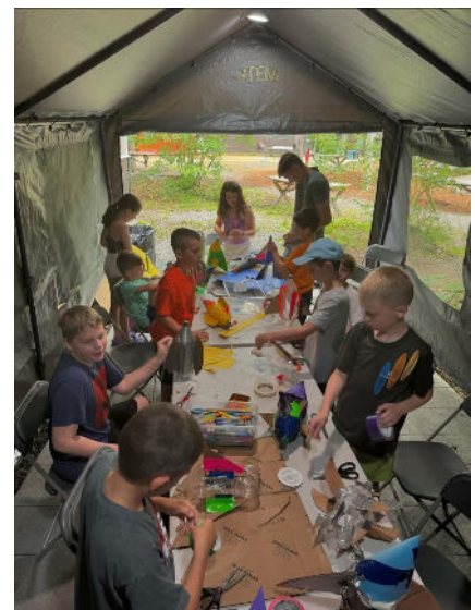
Campers creating masterful bottle rockets to launch