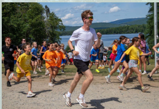
Junior campers starting the Morry's Camp Fun Run